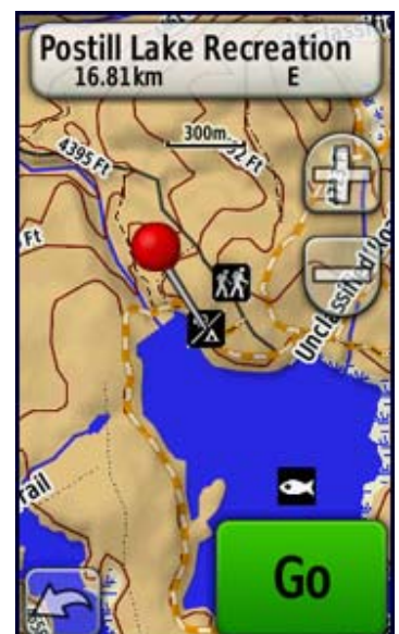
BELOW: Screenshot of Backroad GPS Maps Geo-Referenced Recreation Features